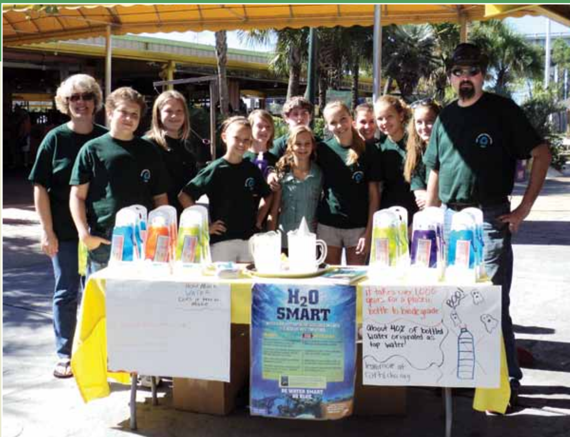
Students from Gulf Shores Middle School, Gulf Shores, AL

One clear proof that students are learning is that they are transferring their knowledge to new situations.