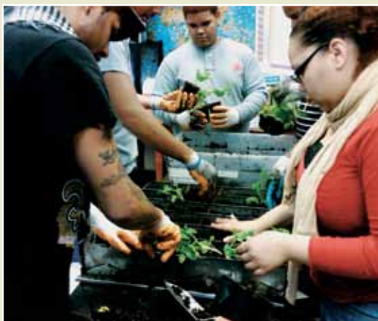
Students from Discovery High School, Bronx, NY